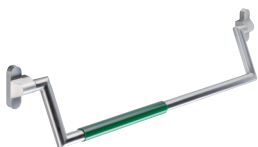
System 162 panic bar