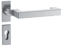
Lever handle design 104X