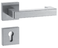
Lever handle design 103X